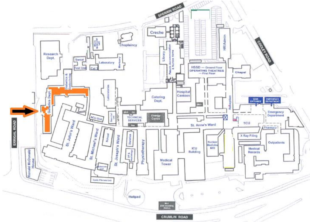
Map of the CHI at Crumlin site. Clinical Genetics shown in orange.